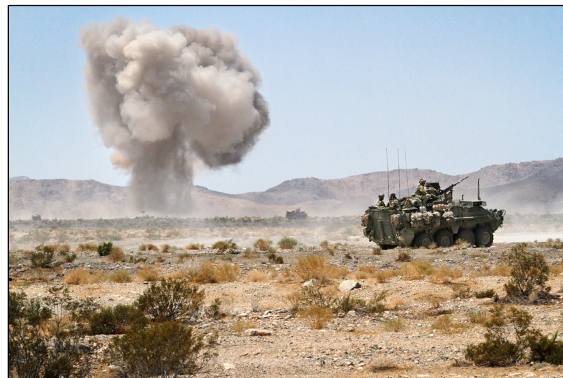
Soldiers of the 56th Stryker Brigade Combat Team, 28th Infantry Division, Pennsylvania Army National at the National Training Center, Fort Irwin, California July-August 2018.