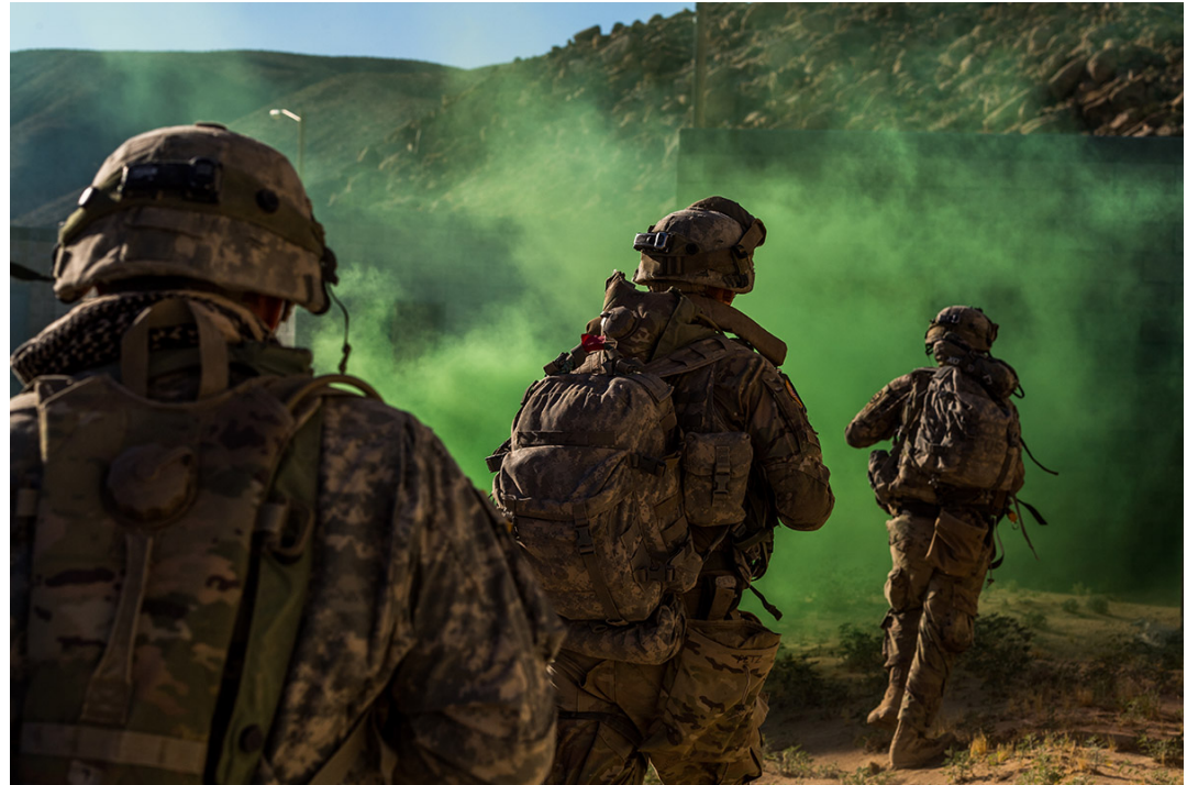
Army National Guard Infantrymen from the 116th Cavalry Brigade Combat Team seize a town from the enemy, June 7, 2019, at the National Training Center in Fort Irwin, California. Seizing the key terrain enabled the 116th CBCT to maneuver pass the previously contested area.

In the first phase of your brigade's operations in Donovan-controlled territory of Atropia, you have fought from east to west along AOA CHAMBERLAIN, through the central corridor. Your sister battalion, 2-3 IN, seized Razish and destroyed enemy forces of the BFB. They are currently preparing to conduct a defense forward vic of Barasu. The cavalry squadron, 1-14 CAV, are conducting a guard vic of Strawberry Fields. They also have OPs with eyes on Echo Valley and report that the 111th BTG are amassing forces for a counter-attack. 1-23 IN is currently the brigade reserve and prepared to reinforce.