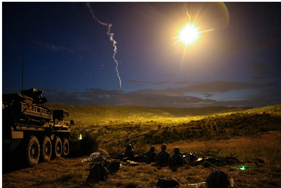
Soldiers from 111th Infantry, 56th SBCT, conduct a night live-fire during Exercise Decisive Strike 2019 at the Training Support Centre, Krivolak, North Macedonia, June 11, 2019.

You are the Battalion AS-3 (Assistant Operations Officer) in 5 th Battalion, 20 th Infantry Regiment (SBCT). Your battalion recently seized Ujen and established security in the city. But before you could transition authority to the Atropian Government, your Brigade S2 reports enemy massing north of Granite Pass. The 111 th BTG is amassing forces and preparing for a counter-attack after your brigade's successful operations in the central corridor. Your battalion commander and S3 returned from the Brigade OPOD having conducted a brief reconnaissance of the objective and they are ready to give you your planning guidance. Prepare to copy.