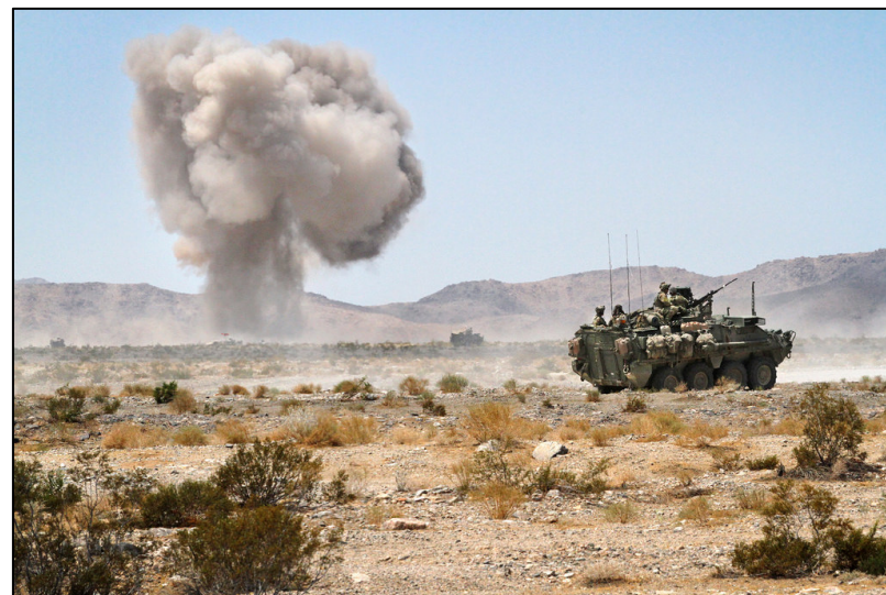
Soldiers of the 56th Stryker Brigade Combat Team, 28th Infantry Division, Pennsylvania Army National Guard at the National Training Center, Fort Irwin, California July-August 2018.