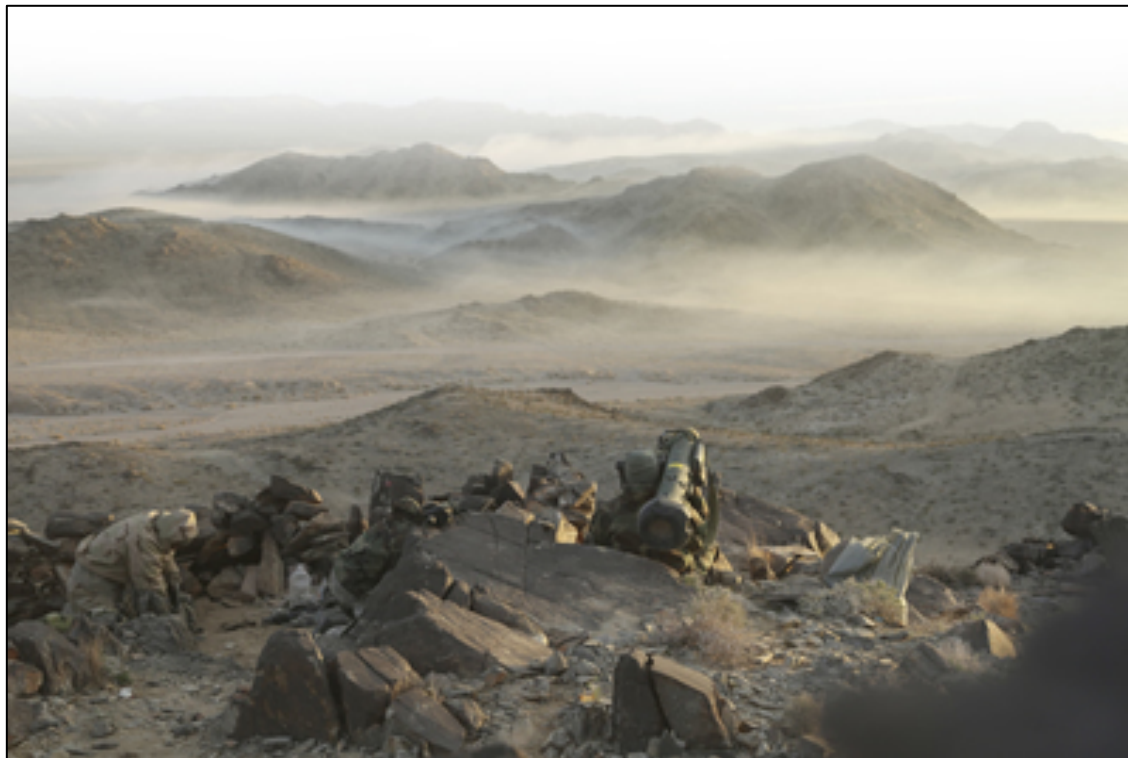
Soldiers from 3-2 Stryker Brigade Combat Team wait to engage enemy vehicles during Decisive Action Training Rotation 14-03 at the National Training Center in Fort Irwin, Calif., on 28 January 2014.

Your slant for Javelins/Squads/Strykers is 9/3/3 and you are the priority for the company 60mm mortar team. (Remember, your slant for Javelins is for rounds, not CLUs - you are at MTOE strength for CLUs). You can pre-plan five targets and submit them to company HQ. During Phase I of the company mission, you can call those pre-planned fires and you are priority for targets of opportunity.