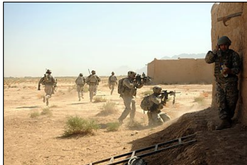
Soldiers of Strike Brigade, 101st ABN DIV (AASLT) during Operation Dragon Strike in Zharay District, Kandahar Province, Afghanistan.

You are the Company Commander of A Company, 2-14 Infantry Battalion of 2nd IBCT, 10th Mountain Division. Your unit is deployed to Southern Afghanistan. For the last three months you've been partnered with the Afghan National Army and conducting offensive operations in Zharay District of Kandahar Province. In the last month, Taliban forces have establish a complex defensive belt along the primary north to south running main supply route (MSR) in your area of operations (AO). This is disrupting the movement of military logistical supplies to the Afghan National Police and, more importantly, is limiting the local populous' access to the primary water supply during the rainy season – the Arghandab River. Your company is tasked with conducting a clearance operation along RTE Hope.